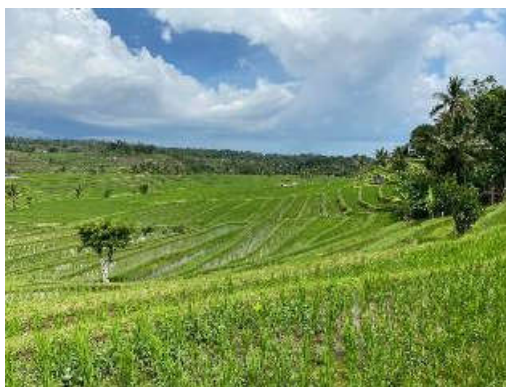
Jatiluwih Rice Terrace, Tabanan, Bali. February, 12 2020