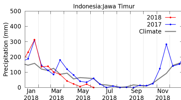
Precipitation Graph by JASMIN: Indonesia Java continues less precipitation condition.

On the other hand, this month is the third month of planting dry season rice, the planting is far behind with normal year due to low level of precipitation. This lack of irrigation water condition seems to be recovered somewhat in Sumatra and Sulawesi Islands due to the rainfall in late May. And, the planting has already started in irrigated area. However, Java Island where the main paddy production area continues low precipitation condition and some farmers changed the planting crop from rice to other crops.