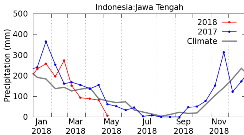
Precipitation Graph by JASMIN: Indonesia continues less precipitation condition.

If it is as usual, this May is the second month of planting dry season rice but it will delay by one or two months due to moderate to low level precipitation, especially in the main paddy production provinces in Sumatera, Java-Bali, South Sulawesi Island and south of Indonesia.