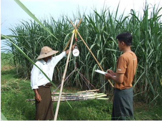
Figure 1. Use of tripod and dial balance (50 kg max) in weighing cane stalks in the field.