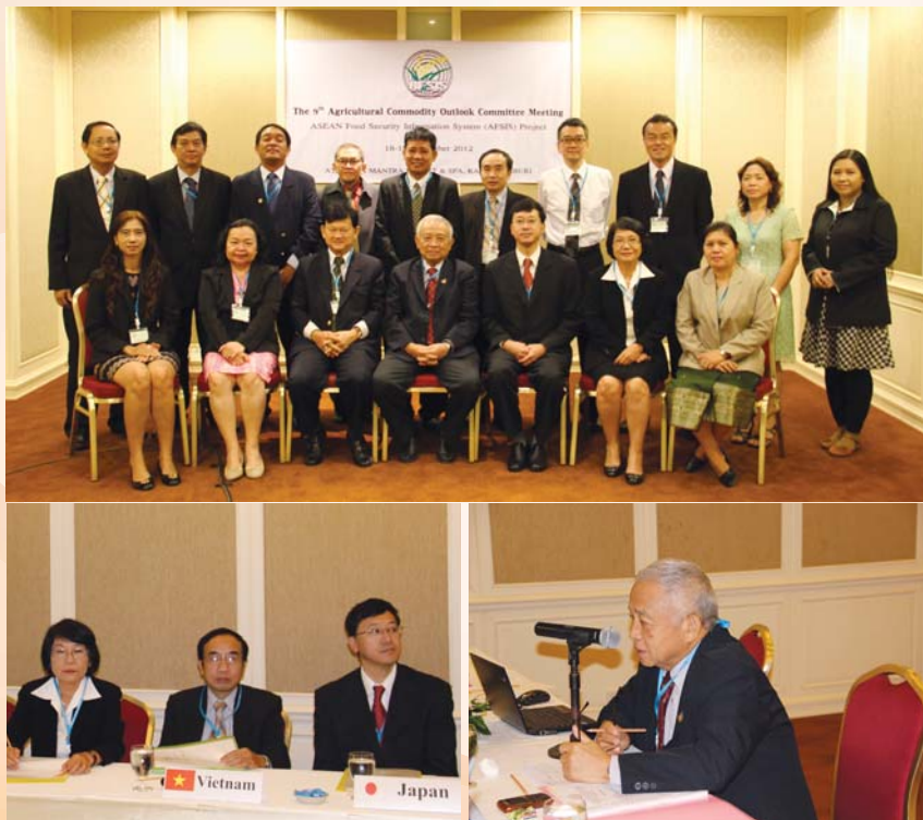
The 9 th ACO meeting 18-19 December 2012, Kanchanaburi, Thailand

cassava. These reports will also be released bi-annually except the ACO reports will be published on June and December. The data content in ACO report are similar to EWI report with the balance sheet of each commodity, import and export, food security ratio, self - sufficiency ratio and FOB/ CIF prices are included. There will also be meetings of ACO Committee prior to publications so that member states are able to scrutinize the data and information for its accuracy and consistency.