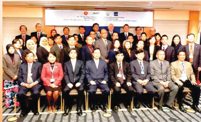
The 6 th DG-ASI and 10 th FP meeting during 14-16 March 2012, Tokyo, Japan

The FPM's objectives are to discuss and prepare work plans on both national and regional level including matters relevant to the project. The new AFSIS website and database need to be improved as the existing website was outdated and the database was lacked of an ability to relate the information. The lack of ability to relate data was overcome by adding the relational database management system (RDBMS) to the existing database. Members of the meeting were also urged to use social networking to promote the AFSIS. The AFSIS learning program's upcoming changes and new programmes to be implemented were also detailed. Furthermore, the Agricultural Land Information System (ALIS) which had been piloted in Lao PDR and Cambodia and is used to estimate land usage statistically was also discussed. The ALIS has great potential and AFSIS plans to update and use ALIS in the rest of 2012. Lastly, the 2012 work plan, the AFSIS structure, the products and services were then discussed and agreed upon. However, a need for further development was noted.