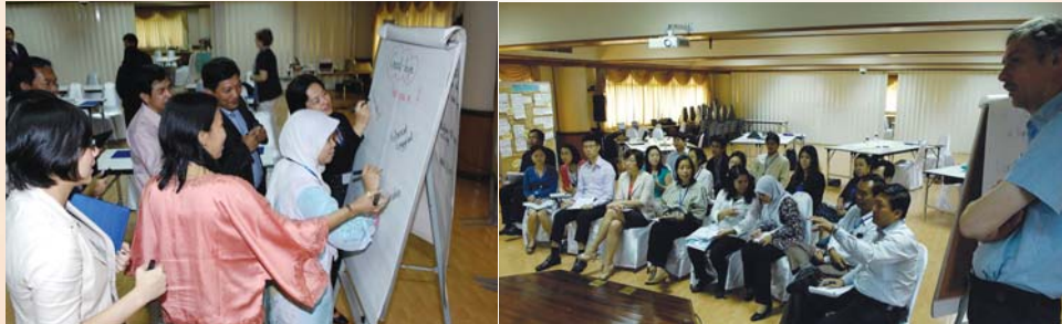
Training on Advanced Learning Programme for ASEAN Food Security Professionals - Year 2 during 20-29 November 2012, Bangkok, Thailand

b) Face-2-Face Workshop : The Workshop was open for participants who passed the online workshop. The Workshop was organized at the Office of Agricultural Economics, Bangkok, Thailand during 20-29 November 2012.