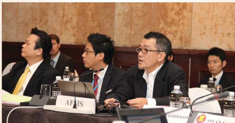
The Consultation Meeting during 22-24 October 2012, Bangkok, Thailand