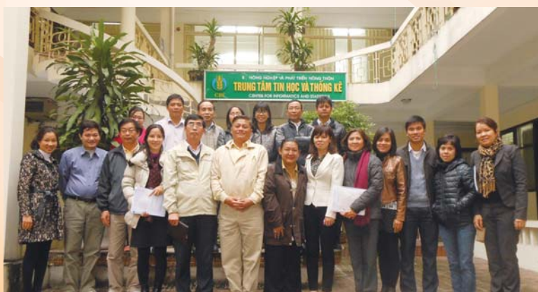
Vietnam-Thailand Mutual Technical Cooperation

There was also a 5 day follow-up site visit after the training with the intention of allowing the participants to observe the National Statistical Office (NSO), practice in a real agricultural survey and to visit some of Thailand's local statistical offices of NSO and OAE.