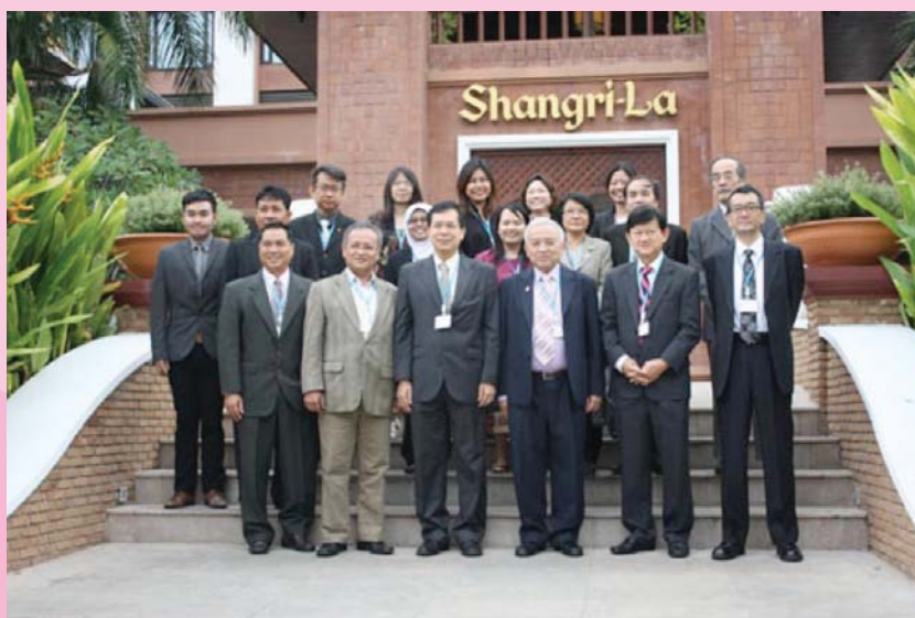
The 7th ACO Committee meeting during 12 – 13 January 2012 in Chiang Mai, Thailand.