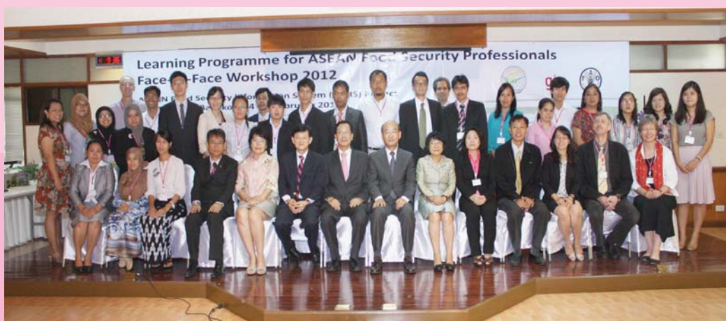
Training course on “Learning Programme for ASEAN Food Security Professionals”