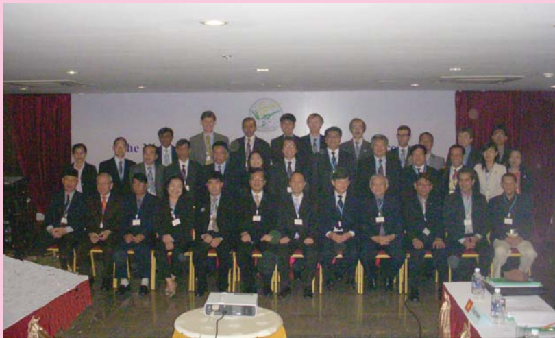
The 9th FPM meeting during 19 – 21 January 2011, Danang, Vietnam