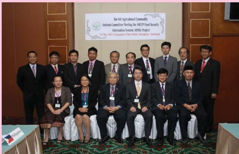
The 6th ACO Committee meeting during 23 – 24 May 2011 in Bangkok, Thailand.