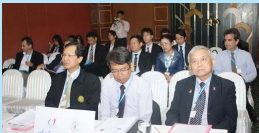
The Roundtable Meeting during 25-26 October 2011, Bangkok, Thailand

For strategy, the Meeting noted six recommendations: 1) linking agricultural statistical system into national statistical system and interagency cooperation, 2) strengthening national country capacity noting the basis of regional food security information came from national data, 3) developing and setting an AFSIS Roadmap, 4) exploring innovative ideas and collaborative project with other stakeholders such as private sector, 5) exploring and expanding partnership with new potential partners such as education institutions, and 6) learning from FIVIM's experience to strengthen and improve food security information.