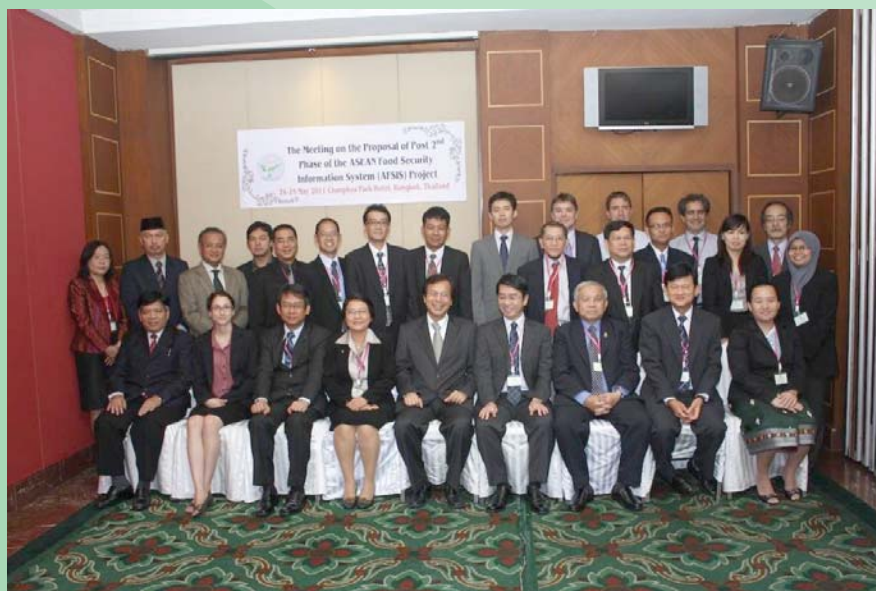
The Technical Meeting during 24-25 May 2011, Bangkok, Thailand