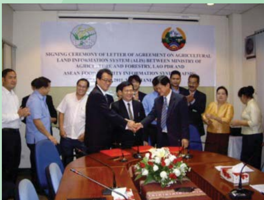
Signing ceremony of ALIS program held on 4 August 2011 in Department of Planning, Ministry of Agriculture and Forestry, Lao PDR