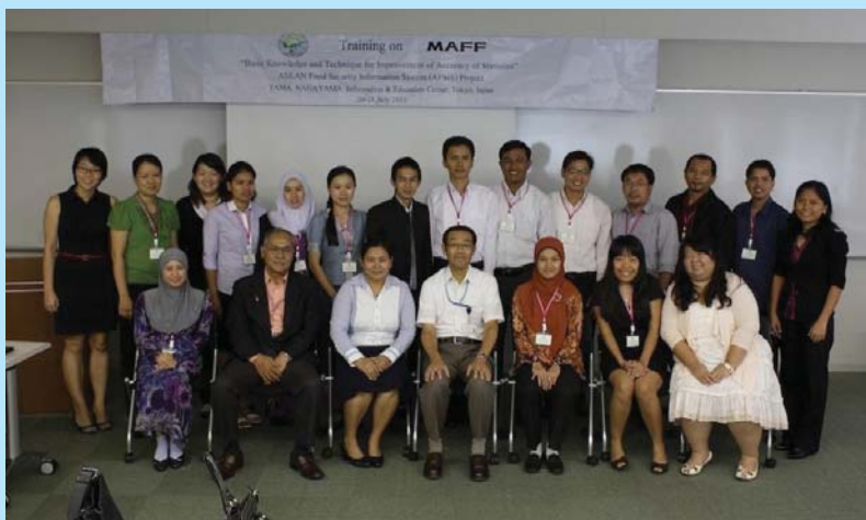
Training course on “Basic Knowledge and Technique for Improvement of Accuracy of Statistics”