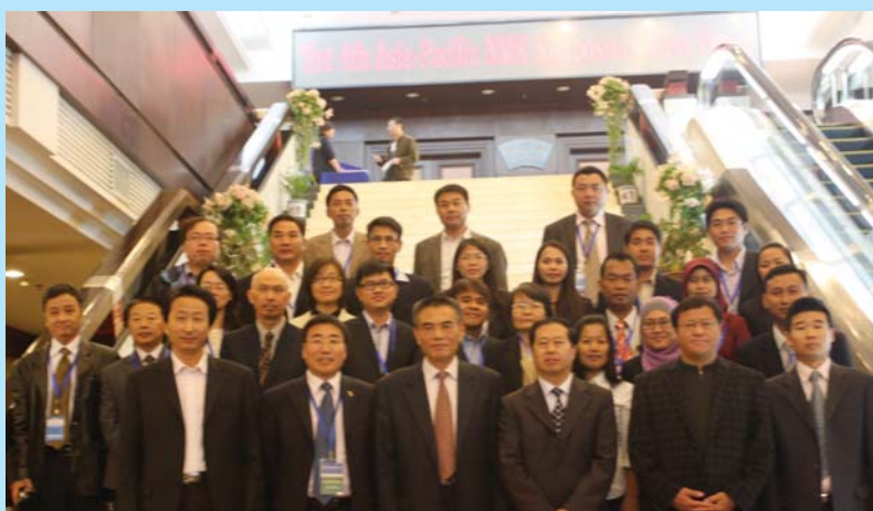
Training course on “China-ASEAN Statistical Information Exchange and IT Service of Food Production”