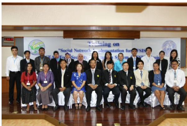
Training course on “Social Network Implementation for AFSIS ”

The name of the participants attended in each training course or workshop are appeared in the Annex 1.