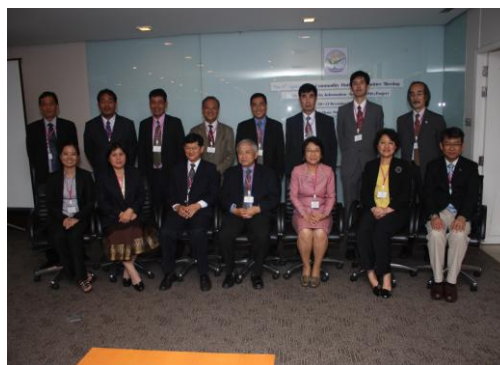
The 5 th ACO Committee meeting during 20 – 21 December 2010 in Pattaya, Thailand.