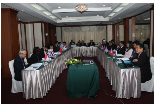
The Technical Meeting during 6 -7 September 2010 in Ayutthaya, Thailand.

prepared based on discussion at the meeting. The detailed concept note of the Technical Meeting is in attachment. The vision of the Post 2 nd Phase is to provide accurate, reliable and timely food security related information that is conducive for policy decision-making and intervention by respective ASEAN+3 Countries and other relevant international organizations, and cooperation in the region. And the goal is to establish a regional self-sustained food security information system with active participation among the ASEAN + 3 countries.