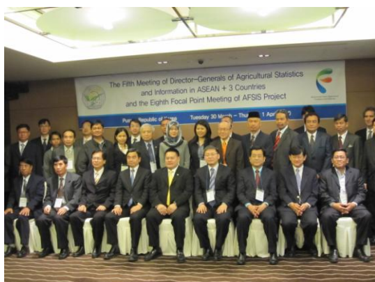
5 th DG-ASI and 8 th FP meeting during 30 March – 1 April 2010, Busan, Korea

However, due to the busy schedule of AFSIS Manager and related staff, the technical meeting has to be postponed to early September 2010.