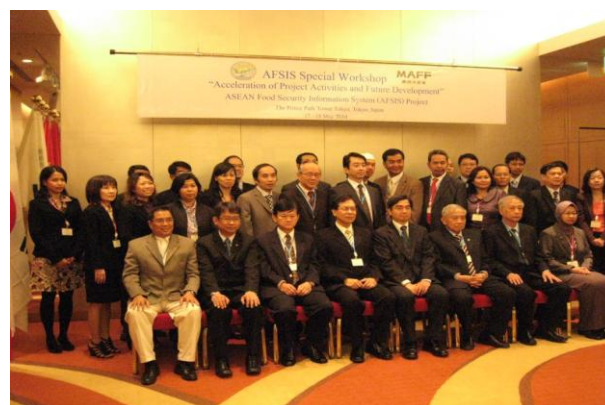
The Regional Workshop during 17 – 18 May 2010, Tokyo, Japan