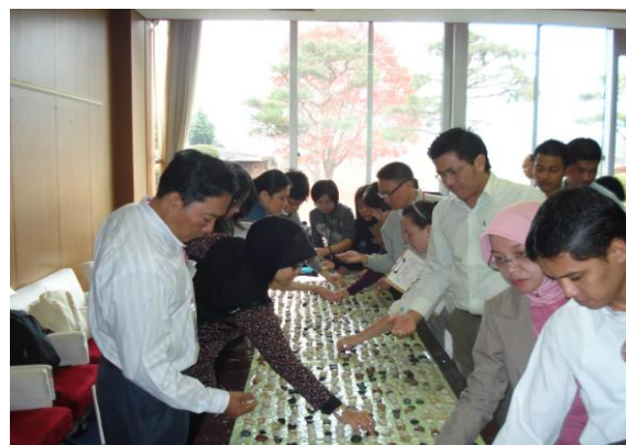
Training course on “Basic Knowledge and Technique for Agricultural Statistics Planning”