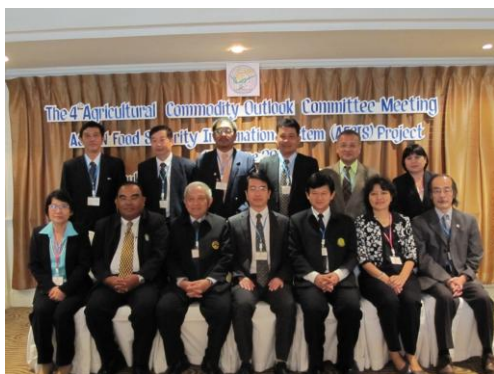
The 4 th ACO Committee meetings during 17 – 18 June 2010 in Phuket, Thailand.

The name of the ACO Committee is shown in Annex 2 – 3.