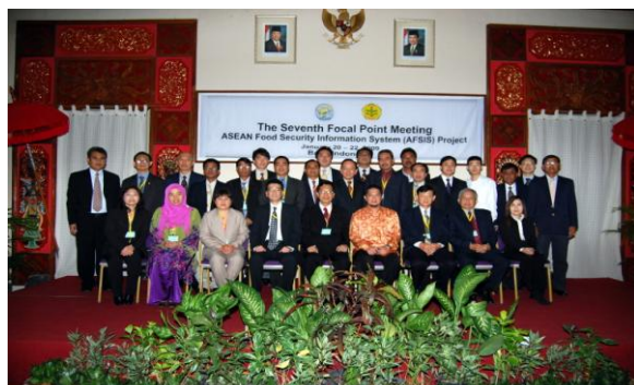
7 th FP meeting during 20 – 22 January 2009 Bali, Indonesia

However, there is no meeting of Director – Generals of Agricultural Statistics and Information (DG – ASI) in 2009 as the DG meeting has planned to organized every second year.