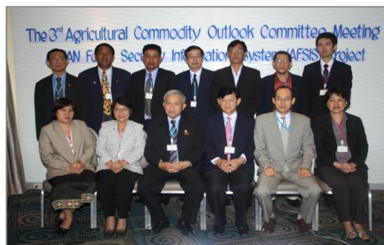
The 3 rd ACO Committee meetings during 13 – 14 January 2010, Petchaburi, Thailand