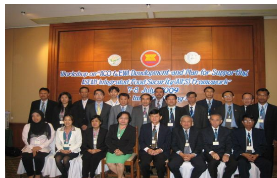
The Regional Workshop during 7 – 8 July 2009, Chiangrai, Thailand