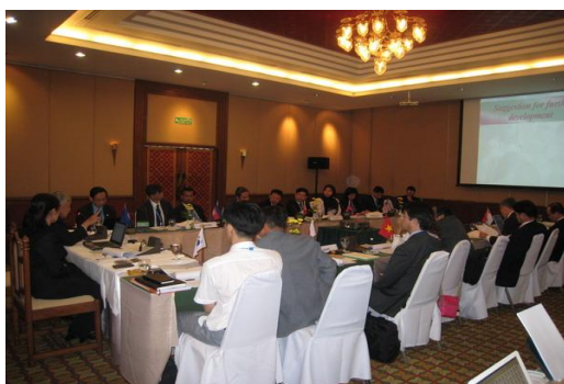
The 2 nd ACO Committee meetings during 6 – 7 July 2009 Chiangrai, Thailand

The name of the ACO Committee is shown in Annex 2 – 3.